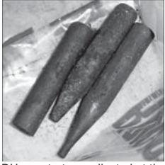
DU penetrators collected at the Twin City Army Ammunition Plant

A DU munition contains a solid metal rod inside the shell. They are sometimes referred to as kinetic energy munitions. The penetrators consist of uranium-238, a radioactive, alpha emitting metallic toxic waste left over from the uranium "enrichment" process. Combined with titanium, the DU alloy is extremely hard and makes devastating armor piercing ammunition. The shells burn through armor upon impact. Over 500 tons of DU was used in the recent Gulf War.