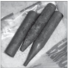
DU penetrators collected at the Twin City Army Ammunition Plant

A DU munition contains a solid metal rod inside the shell. They are sometimes referred to as kinetic energy munitions. The penetrators consist of uranium-238, a radioactive, alpha emitting metallic toxic waste left over from the uranium "enrichment" process. Combined with titanium, the DU alloy is extremely hard and makes devastating armor piercing ammunition. The shells burn through armor upon impact. Over 500 tons of DU was used in the recent Gulf War.